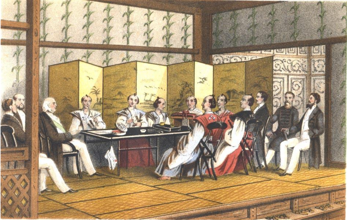
INTERVIEW BETWEEN THE EARL OF ELGIN & THE PRIME MINISTERS OF JAPAN.